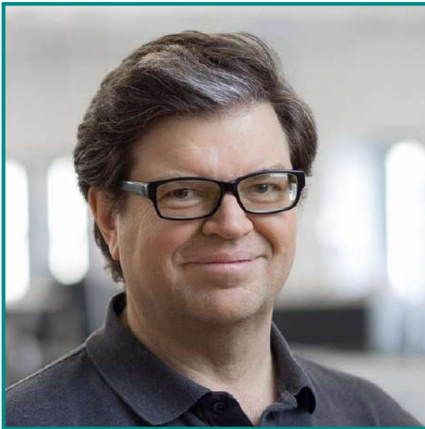
Yann LECUN VP and Chief AI Scientist Facebook

The first Empowerment Summit will feature international experts who will share and exchange views on artificial intelligence and the challenges it raises for our society .