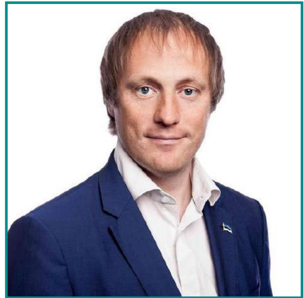
Taavi KOTKA Former CIO Estonian Government